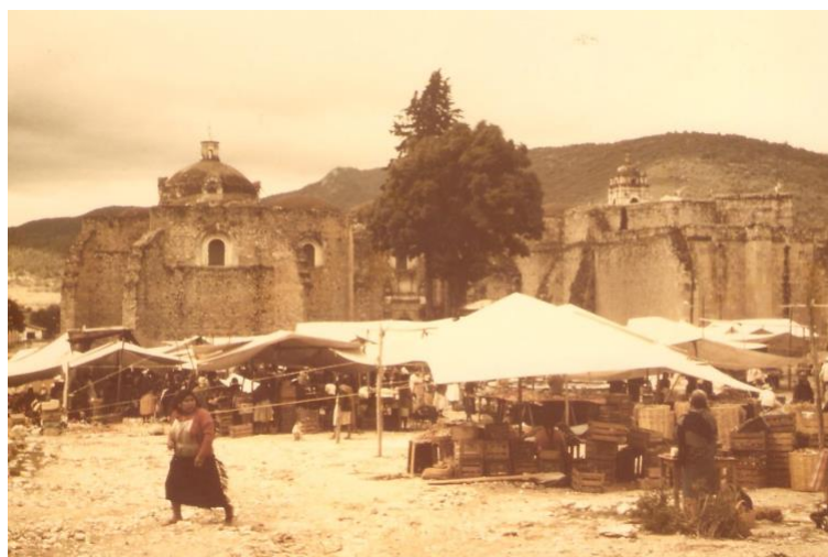
The town square of Teposcolula, June 13, 1974.