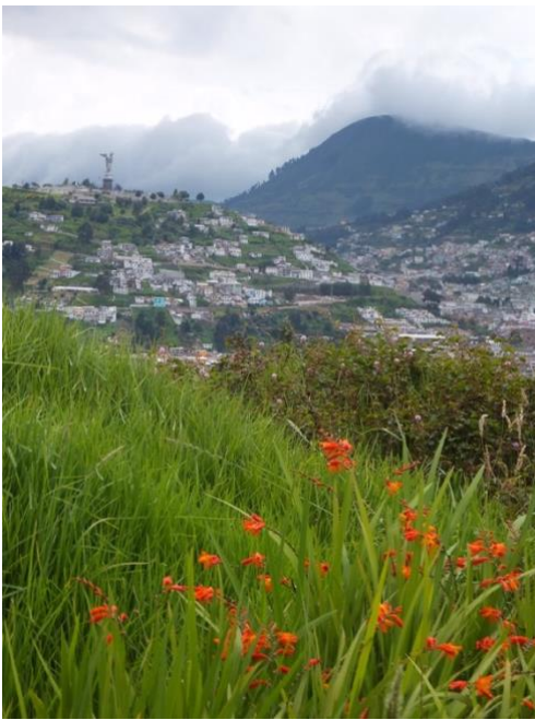
Rich water landscape in the Ecuadorian Andes.