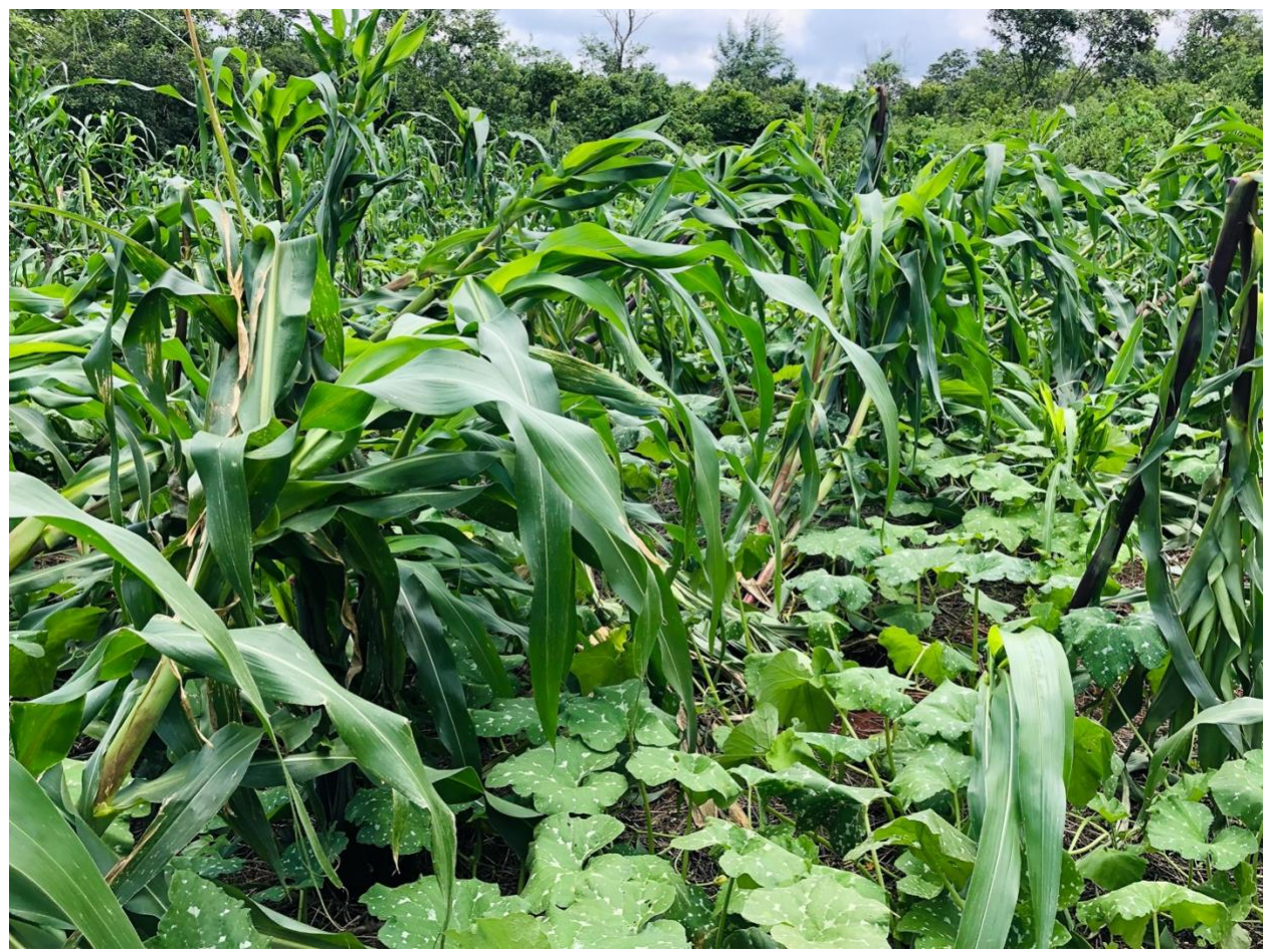
A typical milpa with intercropped maize, squash, and beans.