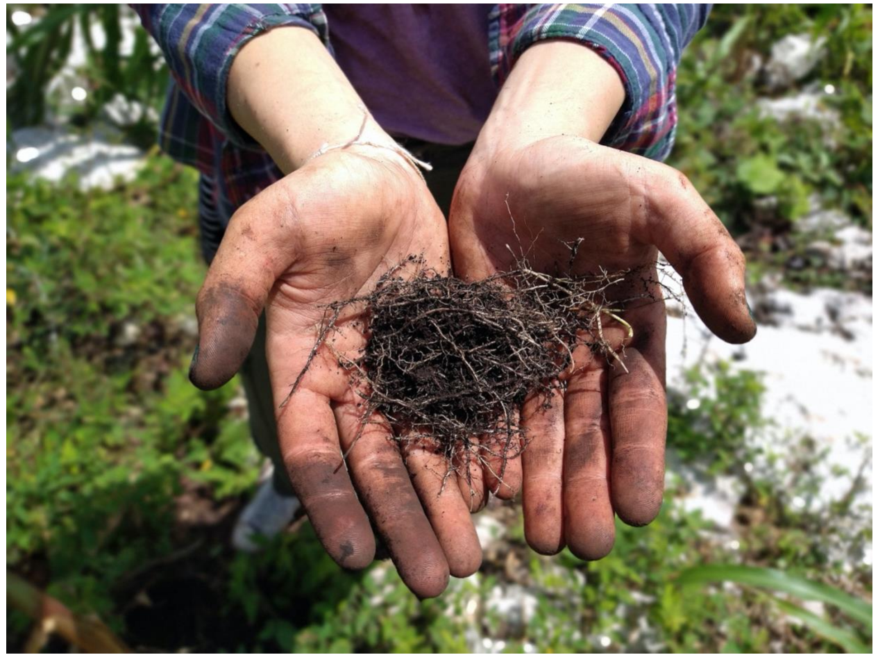
Holding maize roots that will be used for analysis of arbuscular mycorrhizal fungi colonization.