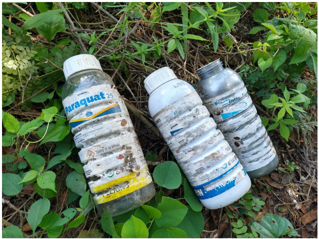
A common sight in fields where agrochemicals are used.