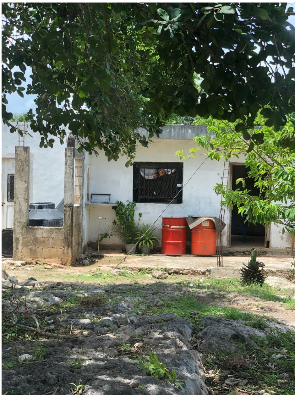
These orange bins outside of the house are where compost for a milpa is produced using kitchen scraps and other organic amendments.